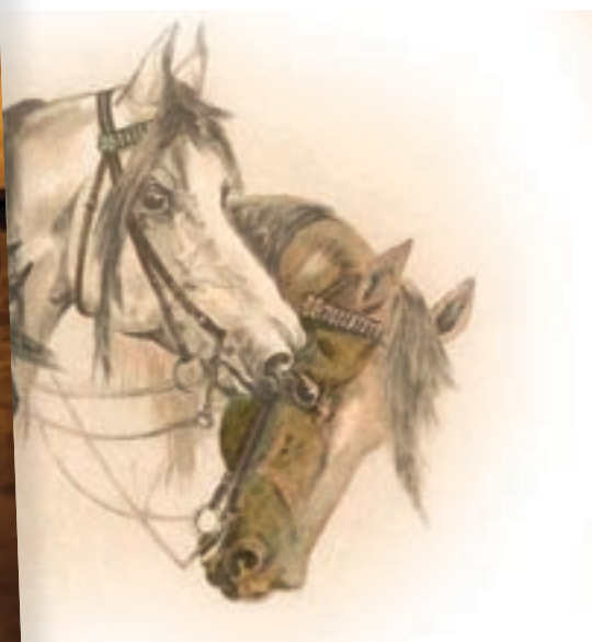
The Forgotten Horses (New World Library, 2008, $45) features Tony Stromberg's stunning photos from 18 horse rescues and sanctuaries across the U.S. Order the book directly from Orphan Acres (below)—50% of the profits directly support the horses as a tax deductible, charitable contribution.