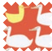
Red Letter Day Lizzy House