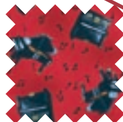
Beautiful Voices Gail Kessler