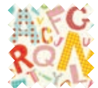
Girl Friday Cosmo Cricket