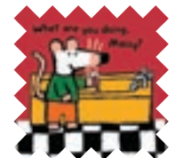
What are you doing today? Maisy™ ©Lucy Cousins 2009